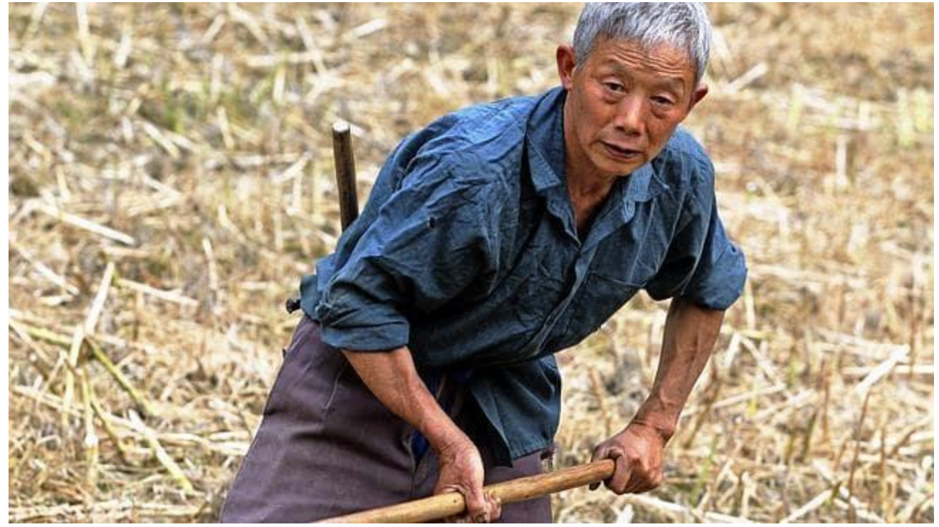
As the developed world runs out of farmers, 'prices need to rise'.